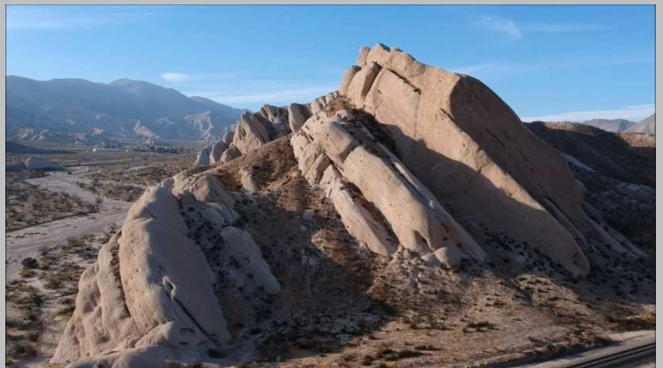
view of the traffic from the Mormon Rocks