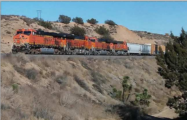
Union Pacific or BNSF train

At Cajon Pass, the fault crosses several major infrastructures - 9 lanes of Interstate 15, US Route 66, two major railroad mainlines (Union Pacific Railway and Burlington Northern and Santa Fe Railway) as well as power, gas and water lines.