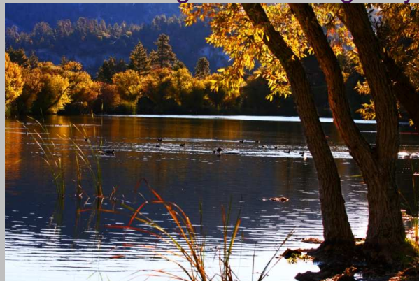
Jackson Lake west of Big Pines

After Valyermo, Big Pines Road runs more or less directly atop the fault, crossing it numerous times during the climb toward the summit. At Big Pines, the fault zone runs under the five-way intersection at the Angeles Crest Highway.