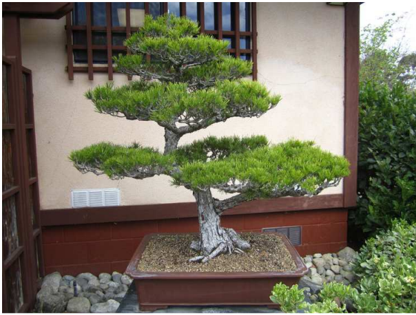
Japanese Black Pine