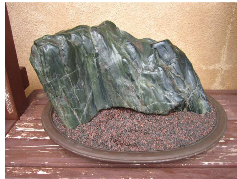
Suiseki (Viewing Rocks) – Island Stone