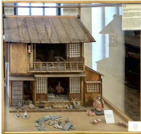
Doll House 1934