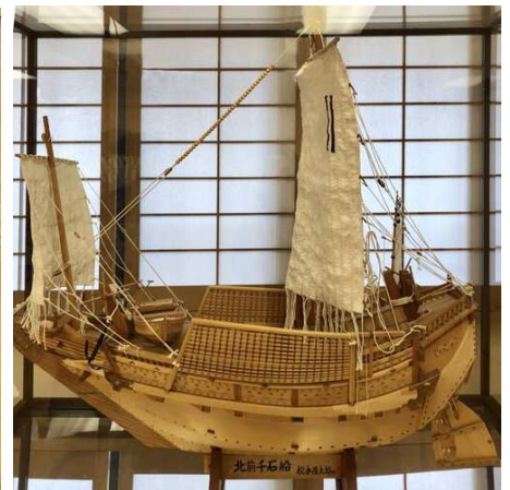
Cargo Ship model