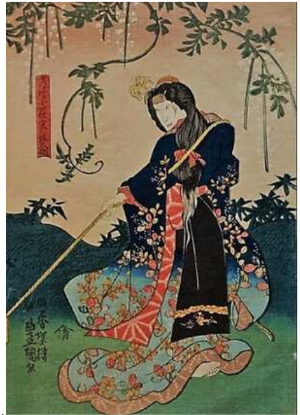
Woodblock Prints (late 18 th to early 19 th century)