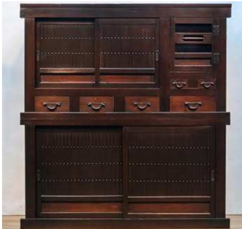
Mizuya Tansu (kitchen cupboard)