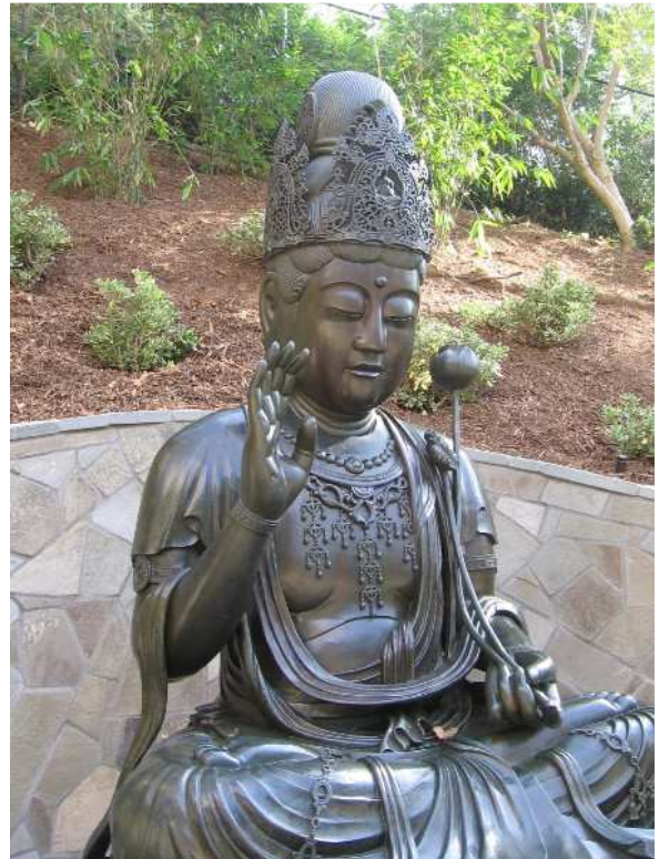
Kannon Bosatsu (goddess of compassion & mercy) – 1735 bronze by Takumi Obata